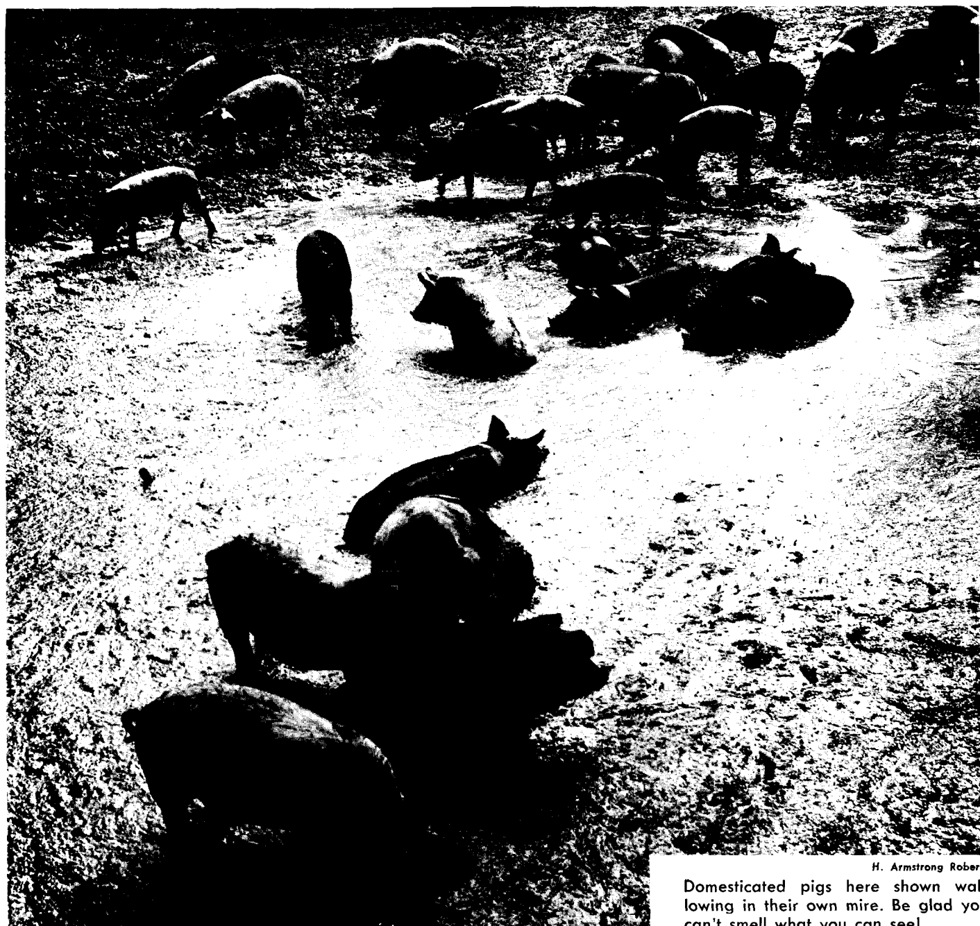
H. Armstrong Roberts

Domesticated pigs here shown wallowing in their own mire. Be glad you can't smell what you can see!